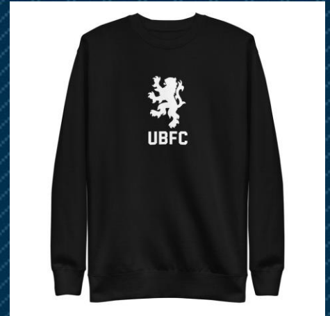
Emblem White Sweatshirt