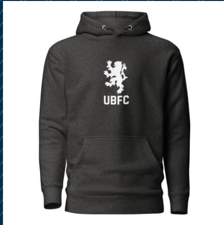
Emblem White Hoodie