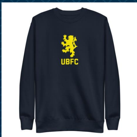
Emblem Yellow Sweatshirt