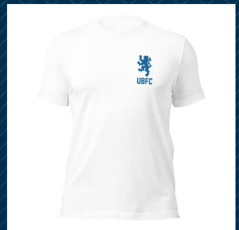
Emblem Blue t-shirt