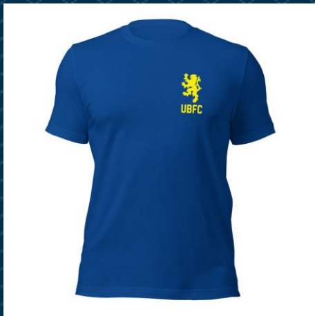
Emblem Yellow t-shirt