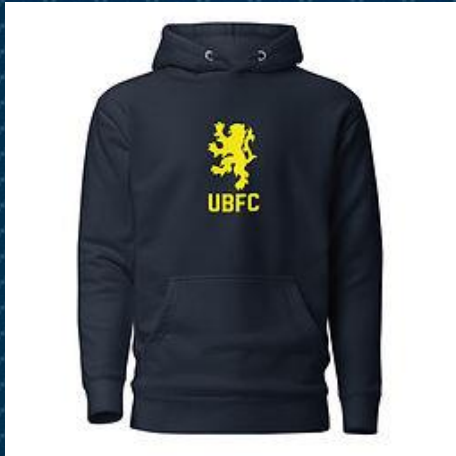
Emblem Yellow Hoodie